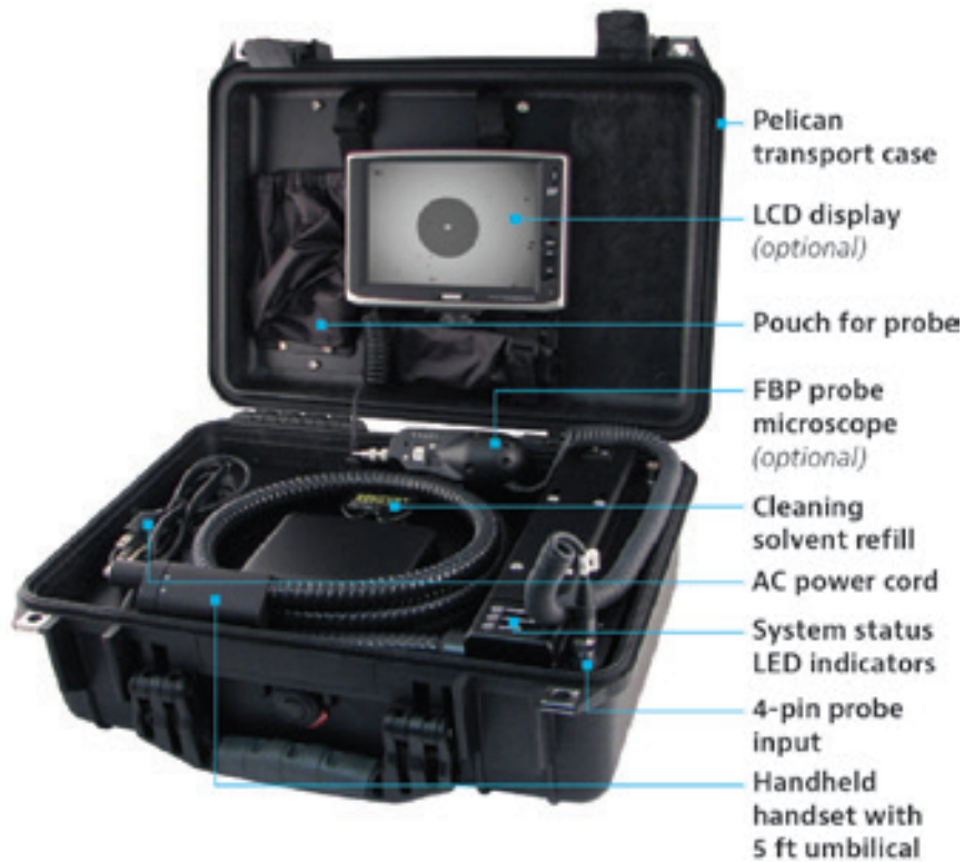
Portable CleanBlast system with FBP probe and LCD