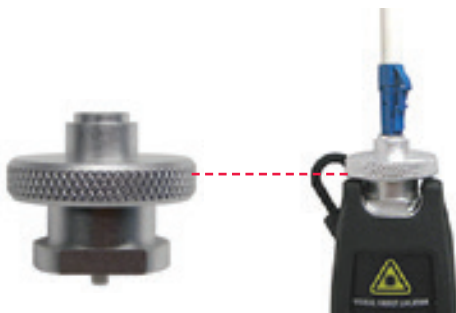
Universal 1.25 mm adapter for FFL-100